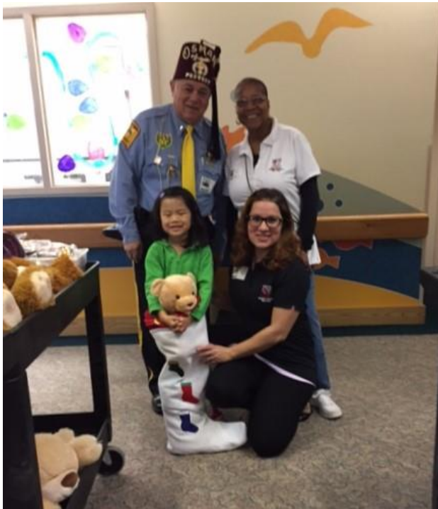
[Perez Family volunteers with patient.]