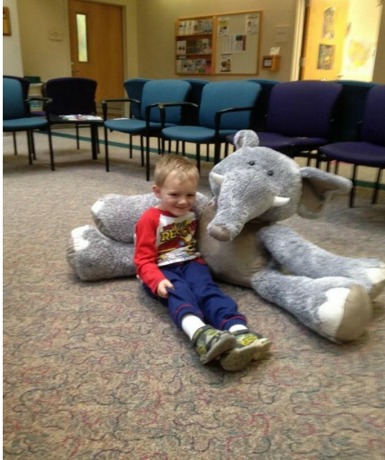
[This little guy decided the elephant was going home with him.]