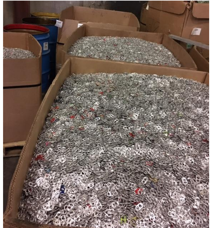
[Remember, every tab counts.]

Next TTW newsletter will be out in February.