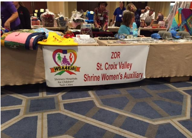
Photo of St. Croix Valley Auxiliary's banner that was used during the Midwest Shrine event held in Bloomington, MN on August 17 & 18.

All mail orders must be prepaid plus $6.00 postage.