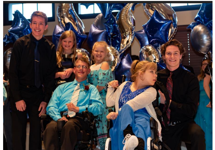
[Patients with escorts.]