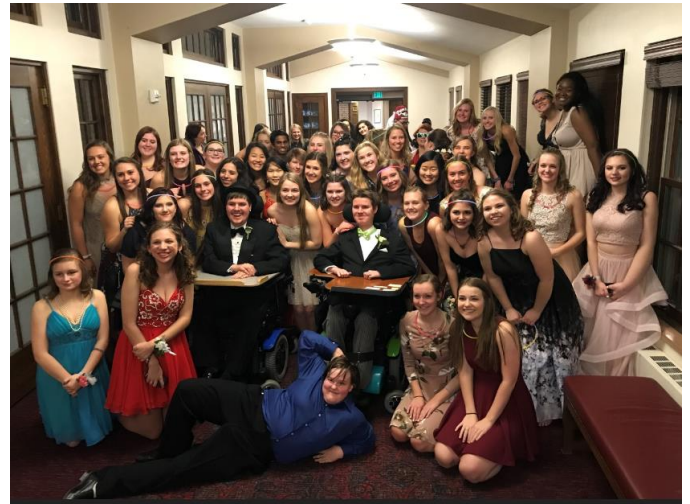
Prom: Group photo